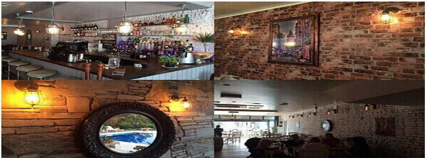
IN BAR---IN AUSTRALIA