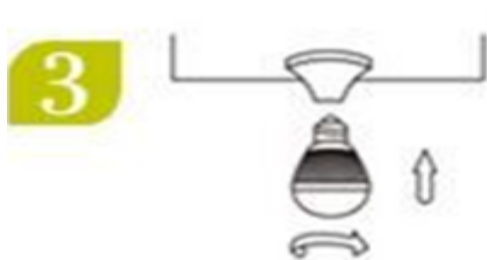
Turn the led lamp in clockwise rotation