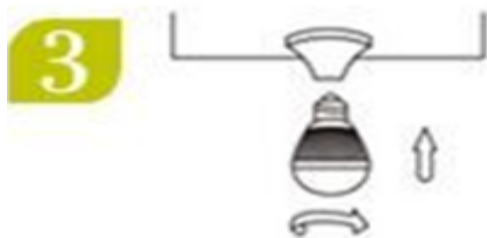
Turn the led lamp in clockwise rotation