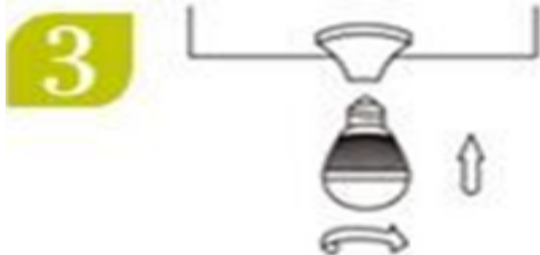
Turn the led lamp in clockwise rotation