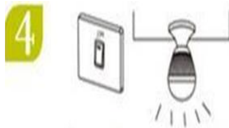
After installation without mistakes,it can be easy to use only push switche closure