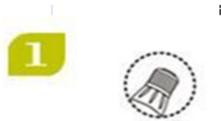
B22 LED LAMP