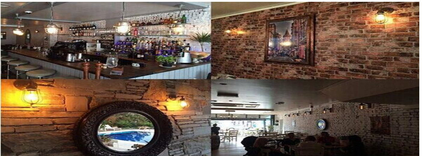
IN BAR---IN AUSTRALIA